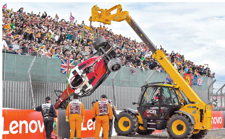
A crane picks up Zhou Guanyu's crashed car at the Silverstone circuit.

Li's wish is every Chinese motor racing fan's dream. The Chinese GP has been missing from the F1 calendar since 2020 due to COVID-19. It's easy to imagine how excited Chinese fans will be at the Shanghai International Circuit when Zhou races at home.